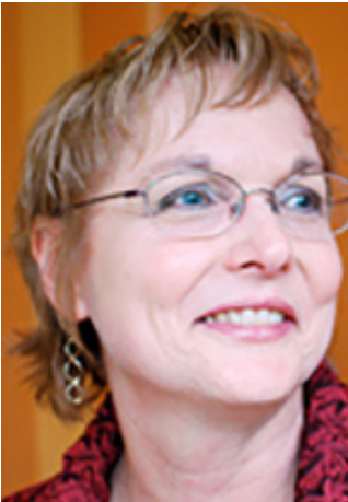
Clinical Professor and Researcher