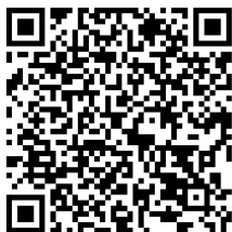
American Bar Association FASD Resolution